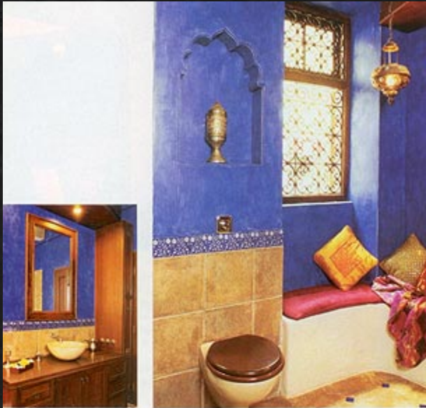
Above: Moroccan-styled bathroom with deep blue. The woodwork on the cabinets, a large mirror with a wide wooden frame, pretty tile borders and a pure white ceiling gives it an old world charm. Seating has been provided in a corner with bright pink upholstery and cushions

A lovely blue colour greets you in the Moroccan-styled bathroom of the McKonkeys. The woodwork on the cabinets, a large mirror with a wide wooden frame, pretty tile borders and a pure white ceiling gives it that old world charm. "Since the bathroom was large, I incorporated a seat in brick and rough plaster to utilize a corner," says Kumpal.